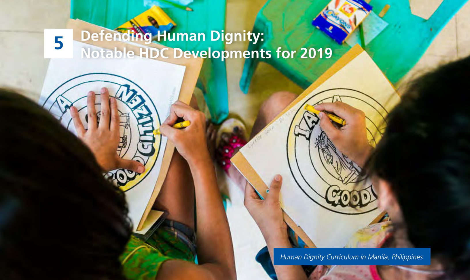
Human Dignity Curriculum in Manila, Philippines