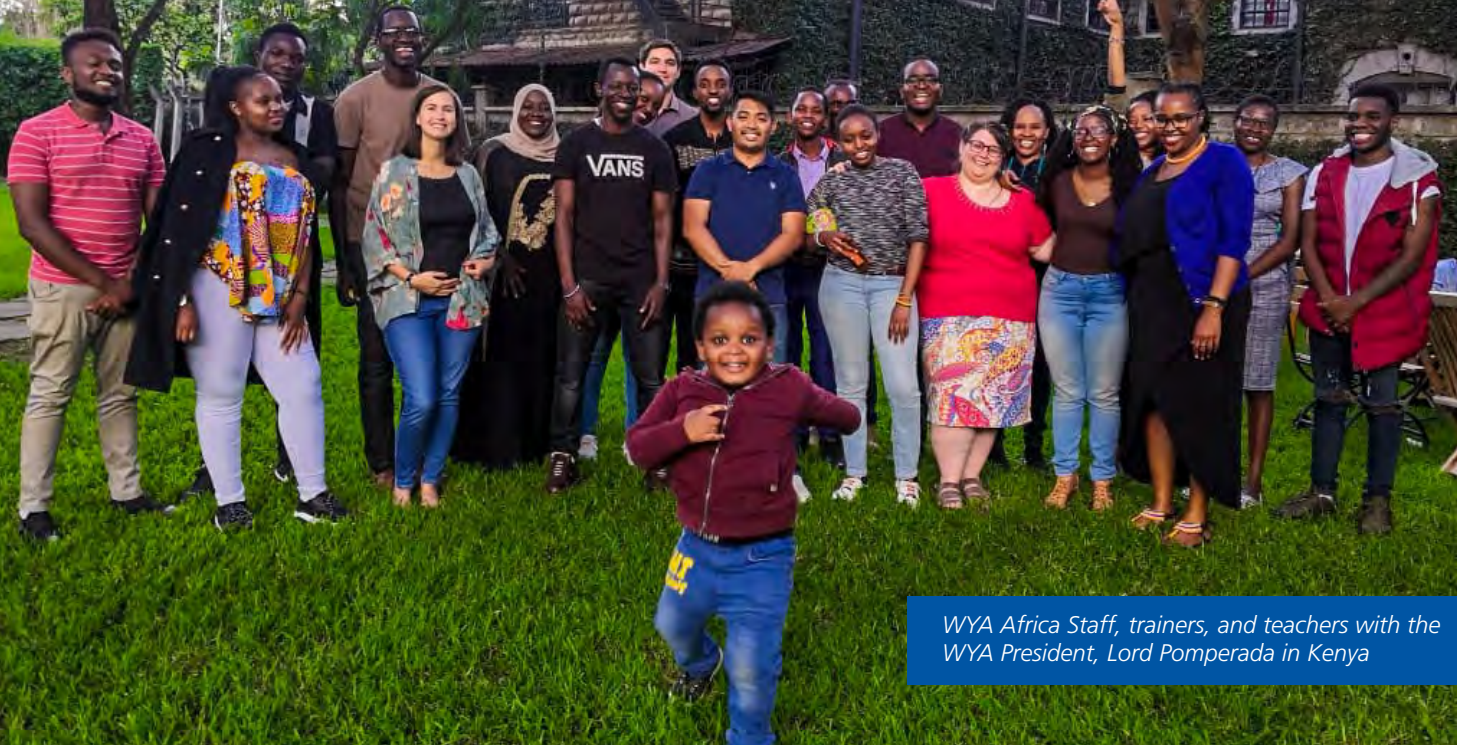
WYA Africa Staff, trainers, and teachers with the WYA President, Lord Pomperada in Kenya

Alongside its programs, WYA continued to be a strong presence in the ongoing conversations for the International Conference on Population & Development (ICPD). In late 2019, WYA representatives attended the ICPD25 Nairobi Summit in Kenya. WYA's attendees found that the Summit focused heavily on the promotion of abortion, comprehensive sexuality education, and increasing the contraceptive prevalence rate. WYA shared daily news on the Summit with our members and allies (including highlights from these meetings), provided key support in drafting statements for partners, and developed a post event analysis. The WYA team also participated in a counter-conference in Nairobi designed to offer alternatives.