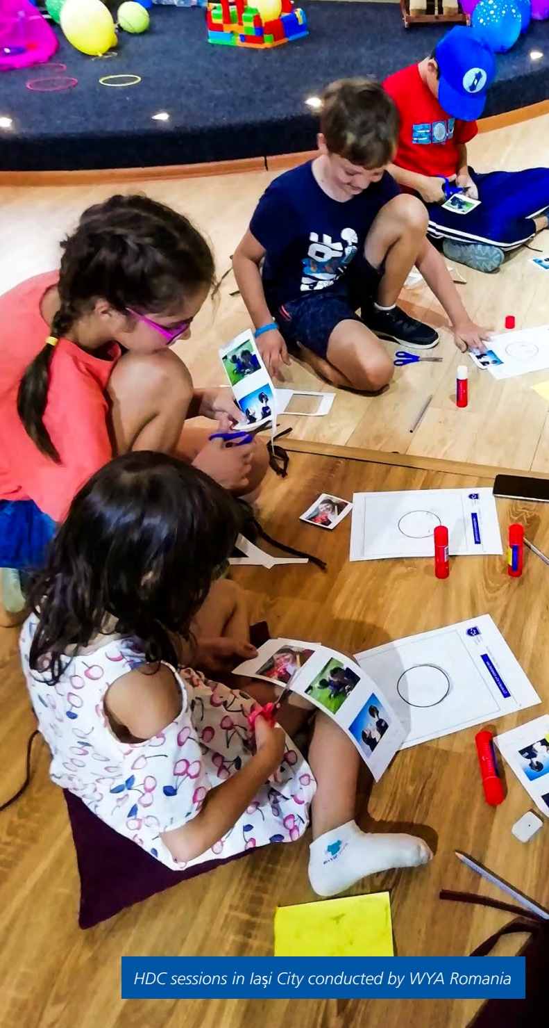
HDC sessions in Iași City conducted by WYA Romania