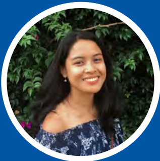
Angel de la Flor Asia Pacific

“WYA brims with opportunities for many young people and it always has a big room for members who are willing to step out and serve!”