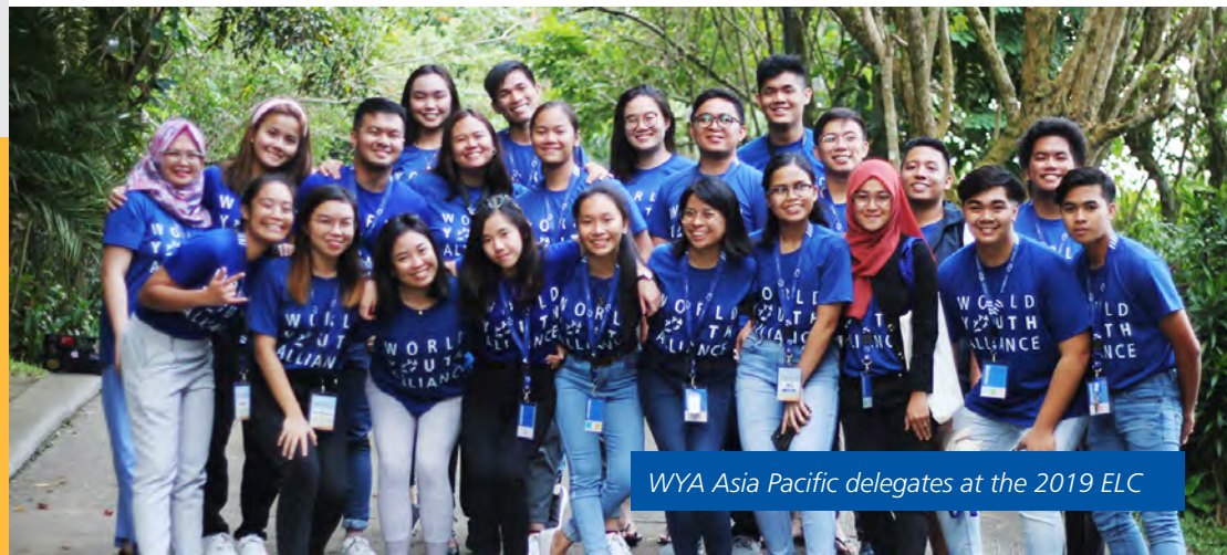
WYA Asia Pacific delegates at the 2019 ELC

The Greater Call, A Forum on Good Governance and Human Flourishing