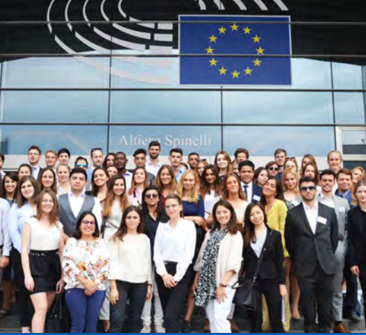
WYA Europe delegates at the 2019 ELC