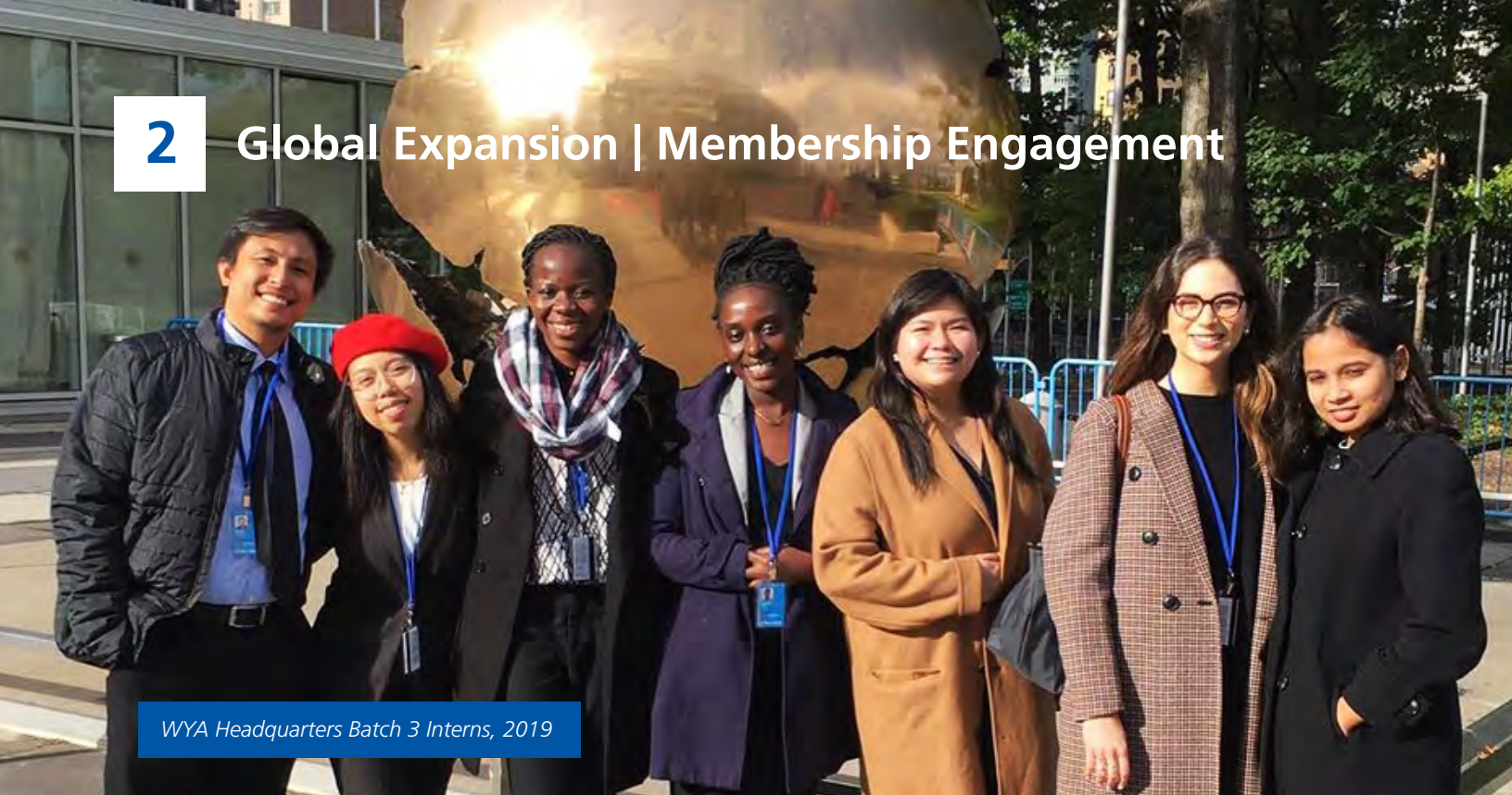
WYA Headquarters Batch 3 Interns, 2019